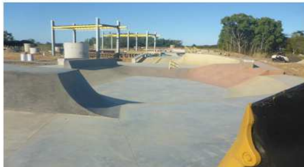
Figure 2 - Skate Park taking shape

For enquiries or for more information, contact Community Engagement on 1300 MACKAY (622 529)