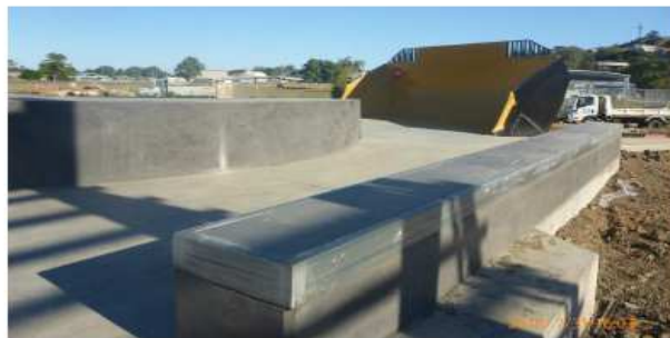
Figure 1 – Skateable Dozer Blade installed